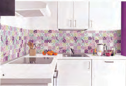
7. Le Pietre 480mm x 480mm tiles in Nera Marquinia, $90/sqm, Di Lorenzo, dilorenzo.net.au. 7. 'Marmo Calacatta' 400mm x 800mm glazed porcelain tile, $73.90/sqm, Harvey Norman, harveynorman.com.au. 8. Target Studio 'Funny' mosaics, $321/sqm, Elite Bathware And Tiles, elitebathware.com.au.