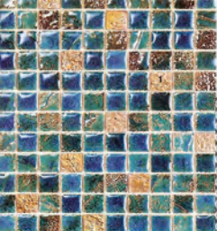
1. 'Precious 77866' mosaics, $564/sqm, Academy Tiles, academytiles.com.au. 2. 'Mono Penny Round 97707' mosaics, from $6.30/324mm x 310mm sheet, Beaumont Tiles, beaumont-tiles.com.au.