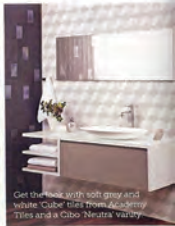
Get the look with soft grey and white 'Cube' tiles from Academy Tiles and a Cibo 'Neutra' vanity.